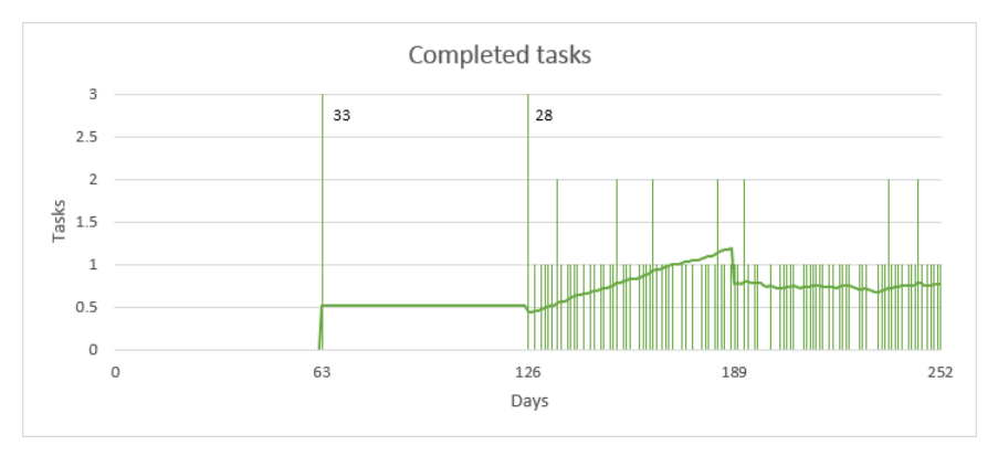
FIGURE 4-1 Plot of completed tasks over four nine-week periods, with a superimposed running average.

Looking at the chart of completed tasks, all tasks are considered completed on the final day of validation during the first two Waterfall periods. The two columns of completed tasks from those periods go about 10 times the height of the chart. I've zoomed in to better view the nine-week moving average line measuring productivity. It starts at around 0.52 tasks per day (33 tasks / 63 days), increases to around 1.2 tasks per day as the results from the second Waterfall milestone combine with the Kanban results, and then settles to around 0.76 tasks per day as the steady stream of Kanban work establishes itself.